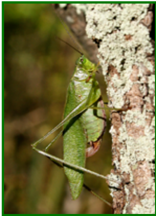
Fork-tailed Bush Katydid

When you are out and about remember there are other insects besides dragonflies to discover.