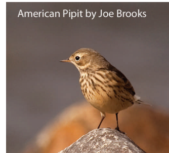
American Pipit

Finally, thanks for your participation, encouragement and appreciation for what we are trying to do. We hope you will continue to join with us as we move into another exciting year of exploring, understanding and appreciating the living world.