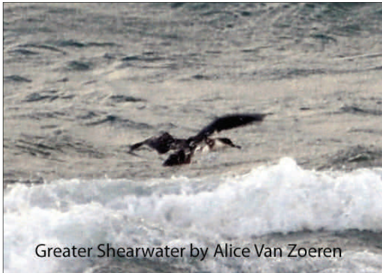
Greater Shearwater

Fall has brought the largest numbers of White-crowned Sparrows I can remember, and reports indicate that it will be a large invasion year for Pine Siskins, with many reports in Michigan and all over the East. Maybe it will be a good finch year to liven up the winter.