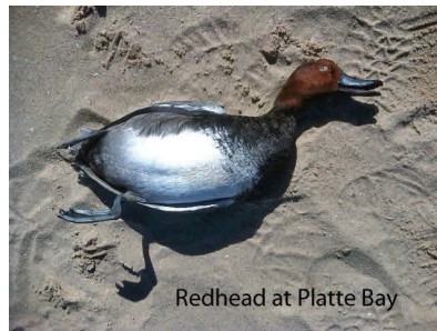
Redhead at Platte Bay