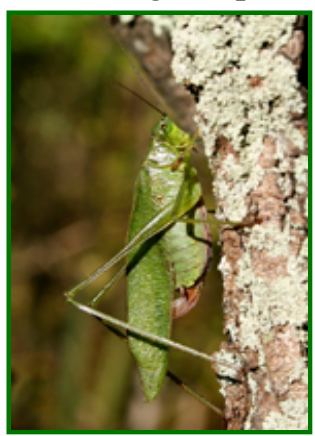
Fork-tailed Bush Katydid When you are out and about remember there are other insects besides dragonflies to discover.

January Meeting - Bats March Meeting- Purple Martins