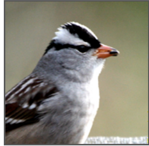
White-crowned Sparrow - Adult Complete with sunflower seed in its bill (not a field mark!)

It has been a good fall for especially Whitesparrows, crowneds. Brian Allen spotted an adult Lesser Black-backed Gull on the beach in Manistee. There was one there last year for a while and sometimes gulls have been known to return to the same place for years. A true vagrant was a Frigatebird reported over Lake Leelanau. This is a bird of tropical seas and was probably forced off course by a hurricane. Oct. is a good time for waterfowl in Lake MI with Cm. Loons, Horned Grebes, Red-necked Grebes, and White-winged Scoters being seen off Pt. Betsie.